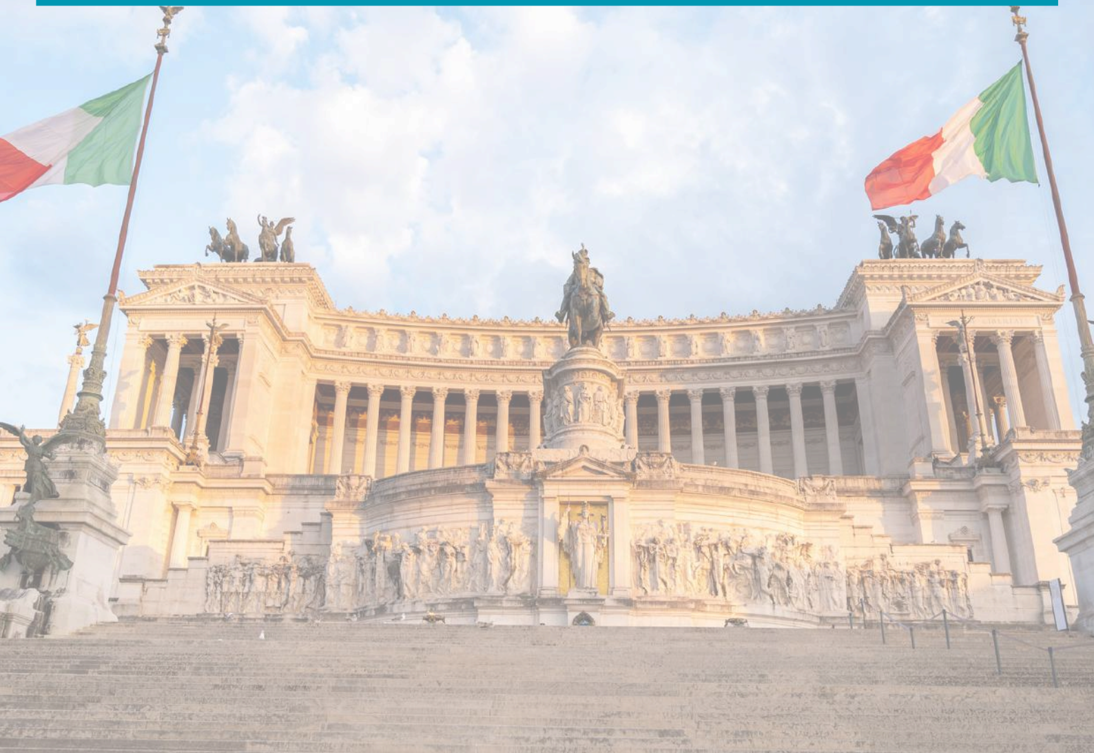
EXHIBIT @ Infectious Diseases 2026